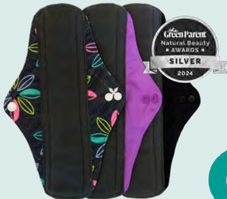
Reusable Period Pads