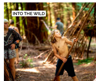
INTO THE WILD

kayaking and stand up paddle boarding on the Exe Estuary, a purpose-built obstacle course, open water swimming and climbing. Expert instructors from the Bear Grylls Survival Academy will teach children and adults essential survival skills such as shelter building, fire lighting and campfire cooking.