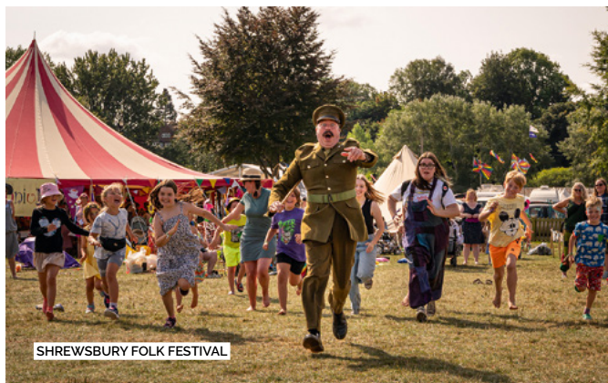
SHREWSBURY FOLK FESTIVAL