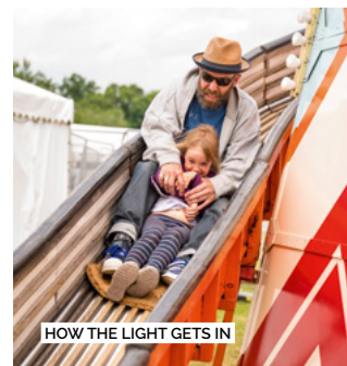
HOW THE LIGHT GETS IN

Freud and Brian Greene. Music lineup features Welsh Music Prize-winning songwriter and producer Gruff Rhys, experimental composer Anna Meredith and BRIT Award-winning indie legends Belle and Sebastian.