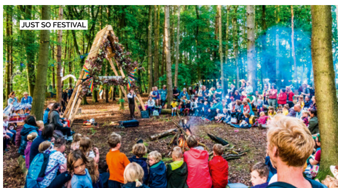
JUST SO FESTIVAL

This nature based festival, encourages festival goers to learn new skills, relax and be yourself. Set in the beautiful Chiddinglye estate in Sussex surrounded by meadows, forests and dark skies, Into the Wild is like a nomadic village of like-minded folk.