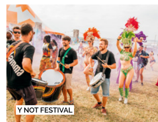
Y NOT FESTIVAL

Y Not Festival is for all ages and an epic weekend away for families. Not only is it a chance to instill really good music taste into your little ones, there's plenty on offer in the daytime. The Circus brings a cast of talented performers ready to dazzle with their brilliant bendy acrobatic skills! Mega Stars provide a range of games, sports and craft activities assisted by specialist sports coaches offering athletics, orienteering, invasion games, multi-skills games, and many more.