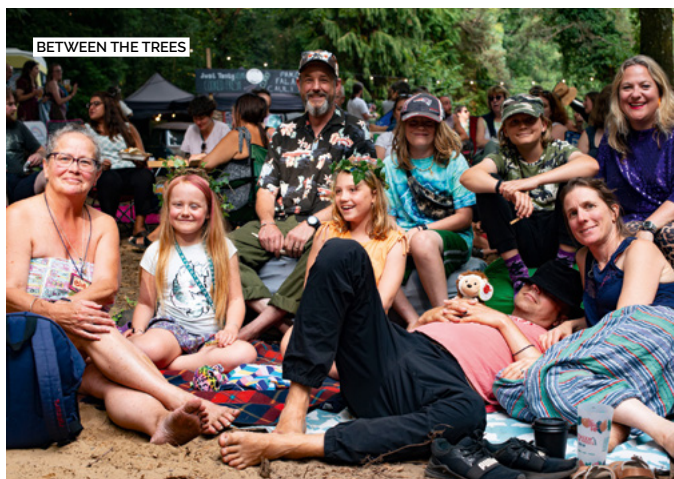
BETWEEN THE TREES

Between the Trees has a unique theme of nature and science, and aims to reconnect people to the natural world. It features a blend of original indie folk music, art and spoken word within a community that embraces all and encourages thinking and creativity. Merthyr Mawr National Nature Reserve is a haven for wildlife, with magical woodland areas, magnificent sand dunes and the sea beyond.