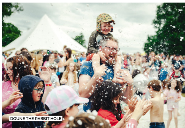
DOUNE THE RABBIT HOLE

A chance to connect to the wilds of nature, share food, skills and good times. This is a unique camp for up to 10 families in rural East Devon. Cook on a campfire, gaze at the stars, run wild through the woods, track creatures of the night, make music, whittle, weave, wallow. Relax. Slow down. Connect. It's properly wild and off-grid – there's cold running water, compost loos, a wild wash area, a covered fire circle, and flat ground to pitch a tent. The day begins with a camp check-in after breakfast.