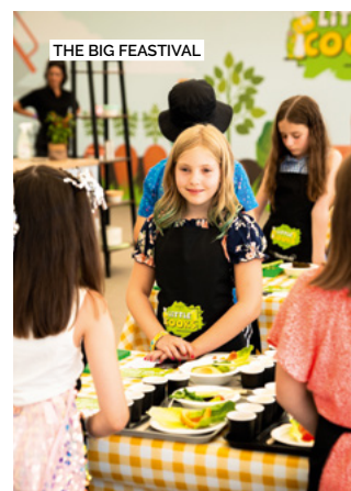
THE BIG FEASTIVAL

At this festival dedicated to food, there's plenty for young foodies too. GROW are hosting workshops about the natural environment, teaching little ones the importance of sustainability, food production and the outside world. The woodland play area uses the natural environment to create magical outdoor spaces. Expect mud cafes, story dens and puppet theatres.