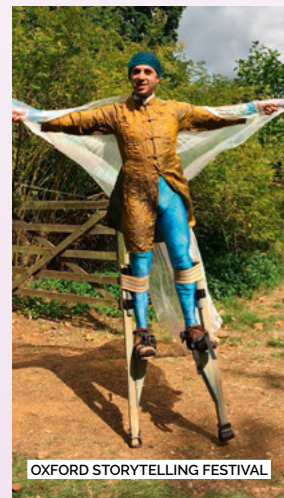
OXFORD STORYTELLING FESTIVAL

This is the third year of this intimate weekend festival weaving stories, spoken word, poetry and song. The theme is 'Wildest Imaginings!' Expect a grand tipi full of stories and magic, handicrafts to try, areas for little ones to explore and perform and fireside stories into the night.