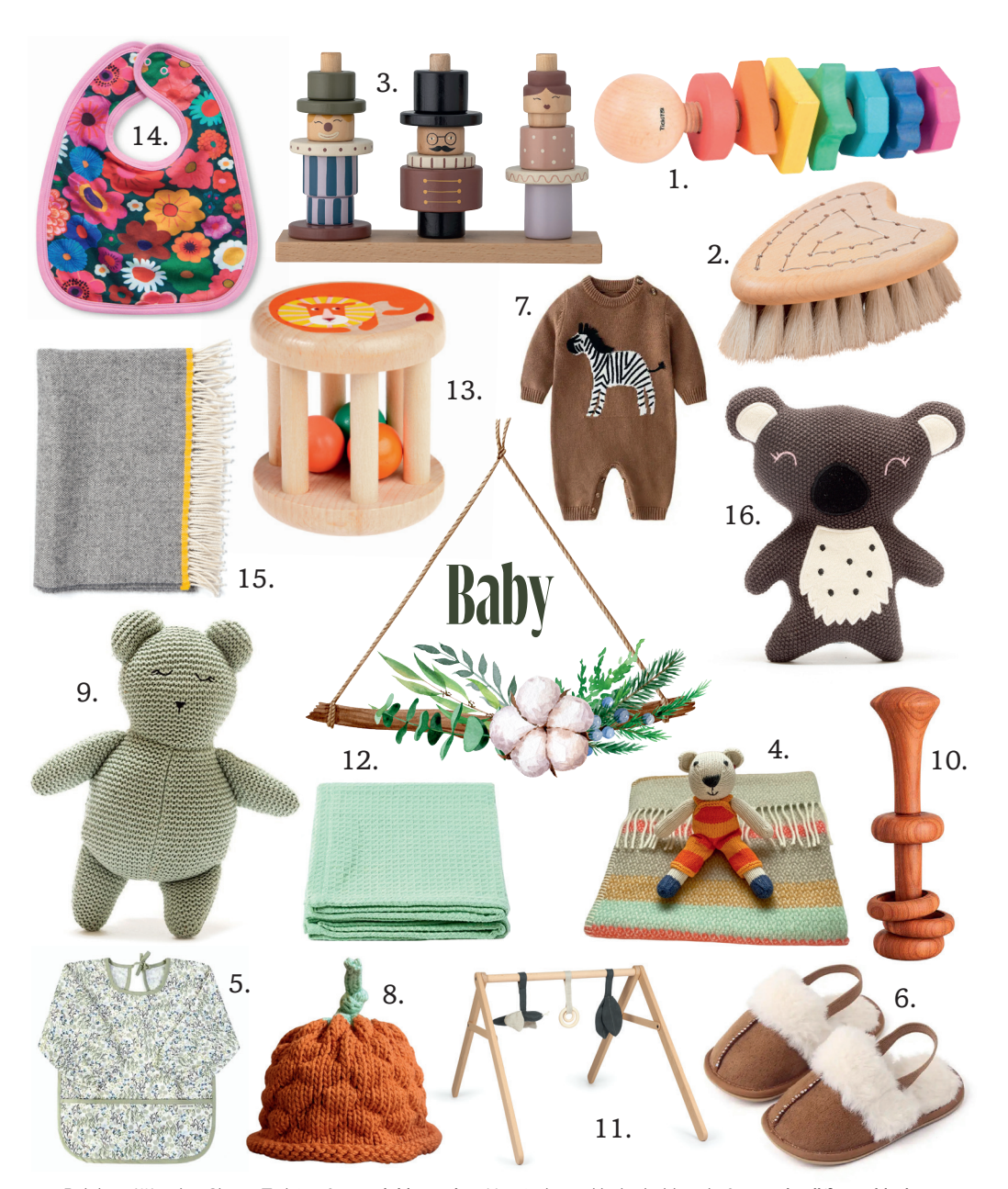
1 Rainbow Wooden Shape Twister, £11.99 tickit.co.uk 2 Heart-shaped baby hairbrush, £23.95 thedifferentkind.com 3 Willia Wooden Activity Toy, £32 bode-living.com 4 New Baby Cuddle Bundle, £65 roryandruby.com 5 Riverbank Sleeved Bib, £22 bellabebe.co.uk 6 Faux Fur Baby Slippers, £9.99 maloetco.com 7 Zebra Baby Romper, £30 maloetco.com 8 Pumpkin Baby Hat, £16 littlespuggy.com 9 Organic Teddy Bear, £16.99 bellabebe.co.uk 10 Personalised Wooden Baby Rattle, from £40 loveheartwood.co.uk 11 Lin Français Activity Arch, £115.95 ellajames.co.uk 12 Organic Cotton Waffle Blanket, £8.99 homescapesonline.com 13 Wooden Rattle, £4.95 rexlondon.com 14 Kip & Co Flower Bed Organic Bib, £12.50 antipodream.co.uk 15 Baby Shawl in Fine Merino Lambswool, £48 thefinecottoncompany.com 16 Koala Toy, £12.50 bellabebe.co.uk