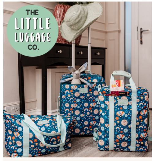
Luggage and packing accessories full of features to take the stress out of packing for your little one. Made from recycled polyester in fun, gender neutral prints.