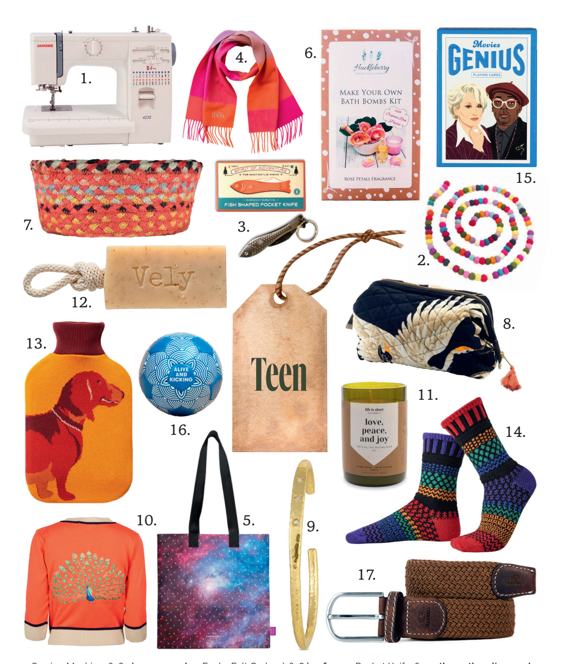
1 Sewing Machine, £369 janome.co.uk 2 Funky Felt Garland, £38 iamfy.co 3 Pocket Knife, £4.95 thenorthernline.co.uk 4 Lambswool Scarf, £27 tartanblanketco.com 5 Cosmic Organic Cotton Canvas Tote Bag, £30 neonimo.co.uk 6 Make Your Own Organic Bath Bombs, £26.99 yellowoctopus.com.au 7 Chilli Mini Basket, £10.50 braided-rug.co.uk 8 Stork Black Velvet Makeup Bag Clutch, £32 onehundredstars.co.uk 9 Nkuku Niru Bracelet in Gold, £60 nkuku.com 10 Vera Coral Peacock Embroidered Cardigan, £74 palava.co 11 Love, Peace and Joy Soy Wax Candle, £19 sazy.com 12 Natural Handmade Soap On a Rope, £7.50 thevelysoapery.com 13 Knitted Hot Water Bottle Cover, £38 palava.co 14 Gemstone Recycled Cotton Socks, £18.95 countrymouse.co.uk 15 Movie Genius Card Deck, £9.99 laurenceking.com 16 Fairtrade leather football, £35.95 thedifferentkind.com 17 Leather Braided Belt, £31 thenauticalcompany.com