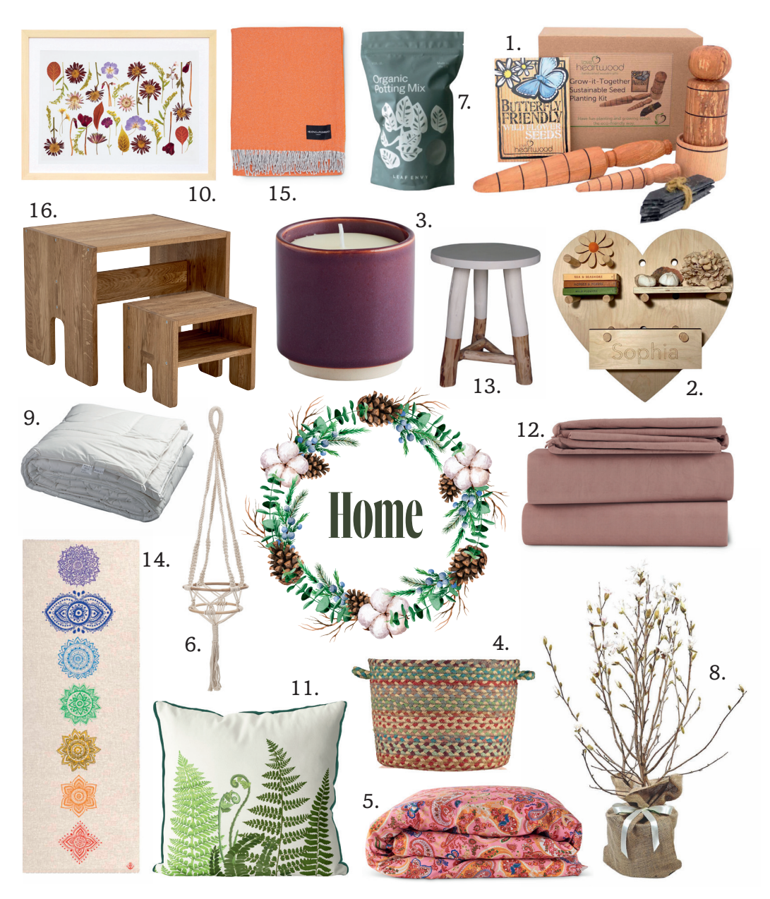
1 Seed planting Kit, £35 loveheartwood.co.uk 2 The Heart Peg Board, £90 pegboarders.com 3 Inspiritus Scented Winter's Eve Pot, £14.50 st-eval.com 4 Carnival Organic Jute Basket, £25 braided-rug.co.uk 5 Paisley Organic Cotton Duvet Cover, £109 antipodream.co.uk 6 Cotton Hanging Planter, £49 cuckooland.com 7 Peat Free Houseplant Potting Mix, £10 leafenvy.co.uk 8 Magnolia Stellata Tree, £42.50 treesdirect.co.uk 9 Merino Wool Medium Weight Duvet, £129 pigletinbed.com 10 Pressed Floral Art, £35 handmadeinbritain.co.uk 11 Green Leaf Cushion, £62 fabfunky.com 12 Himalayan Pink Bamboo & Linen Bedding Set, £145 cuckooland.com 13 Rustic Dipped Stool, £79 incentandbarn.co.uk 14 Hemp Biodegradable yoga mat, £90 thepositive.co 15 Cashmere Blanket, £375 heating-and-plumbing.com 16 Bloomingville Stool, £175 sweetpeaandwillow.com