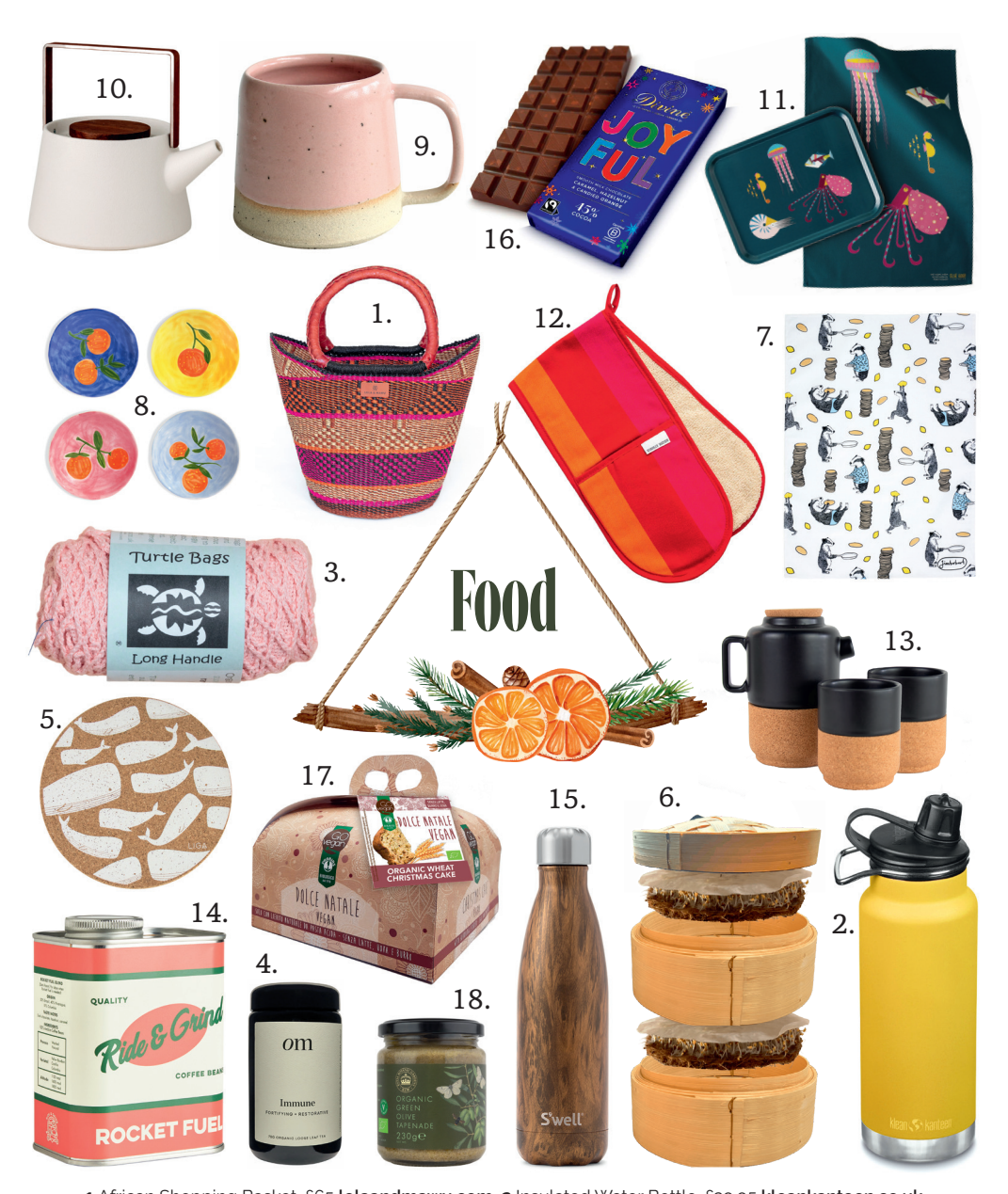
African Shopping Basket, £65 lolaandmawu.com 2 Insulated Water Bottle, £39.95 kleankanteen.co.uk Turtle Bags Organic String Bags, £8 thedifferentkind.com 4 Organic Immune Tea, £34.90 thedesigngiftshop.com LIGA sustainable cork placemat, £7 loveliga.com 6 Steam Pot Crops, £25 sillygreens.com Badger Pancakes Tea Towel, £12.50 jimbobart.com 8 Set of 4 Colourful Plates, £49 bode-living.com Handmade Pale Pink Mug, £26 habulous.co.uk 10 Tulā teapot with 3 teas, £170 asmi.store Sea Creatures Tray + Tea Towel Gift Set, £31 elliegood.co.uk 12 Double Oven Gloves, £31 maisonelhoria.com Eco Tea Gift Set, £63 loveliga.com 14 Rocket Fuel Coffee Beans, £15.99 fiveanddime-interiors.com S'well Vacuum Insulated Water Bottle, £24.50 cuckooland.com 16 Joyful Christmas Bar, £5 divinechocolate.com Vegan Panettone, £16 freefromitaly.co.uk 18 Kew Organic Green Olive Tapenade, £5 odysea.com