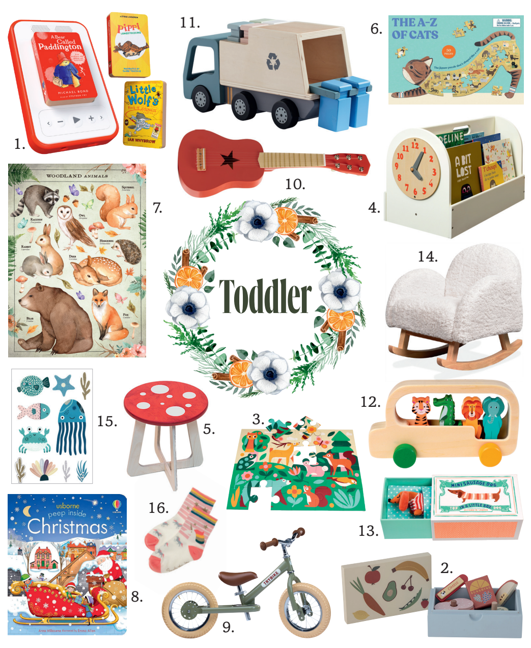
1 Audio Book Starter Pack, £59.99 voxblock.co.uk 2 Lunch Box Play Set, £44 bode-living.com 3 Woodland Floor Puzzle, £9.95 rexlondon.com 4 Tidy Books Box, £99 uk.tidybooks.com 5 Toadstool Chair, £60 littlefolksfurniture.co.uk 6 A-Z of Cats Jigsaw Puzzle, £14.99 laurenceking.com 7 Woodland Animals Chart, £24 inkanddrop.com 8 Peep Inside Christmas, £8.99 usborne.com 9 2 in 1 Balance Trike, £139.95 cuckooland.com 10 Kids Concept Wooden Toy Guitar, £27.95 cuckooland.com 11 Recycling Truck, £43.95 cuckooland.com 12 Wooden Bus, £14.95 rexlondon.com 13 Mini Sausage Dog In A Little Box, £9.95 rexlondon.com 14 Mini Boucle Rocking Chair, £245 ellajames.co.uk 15 Eco-Friendly Suitcase Stickers, £15 littleluggage.co.uk 16 Unicorn Kids Socks, £6 sophieallport.com